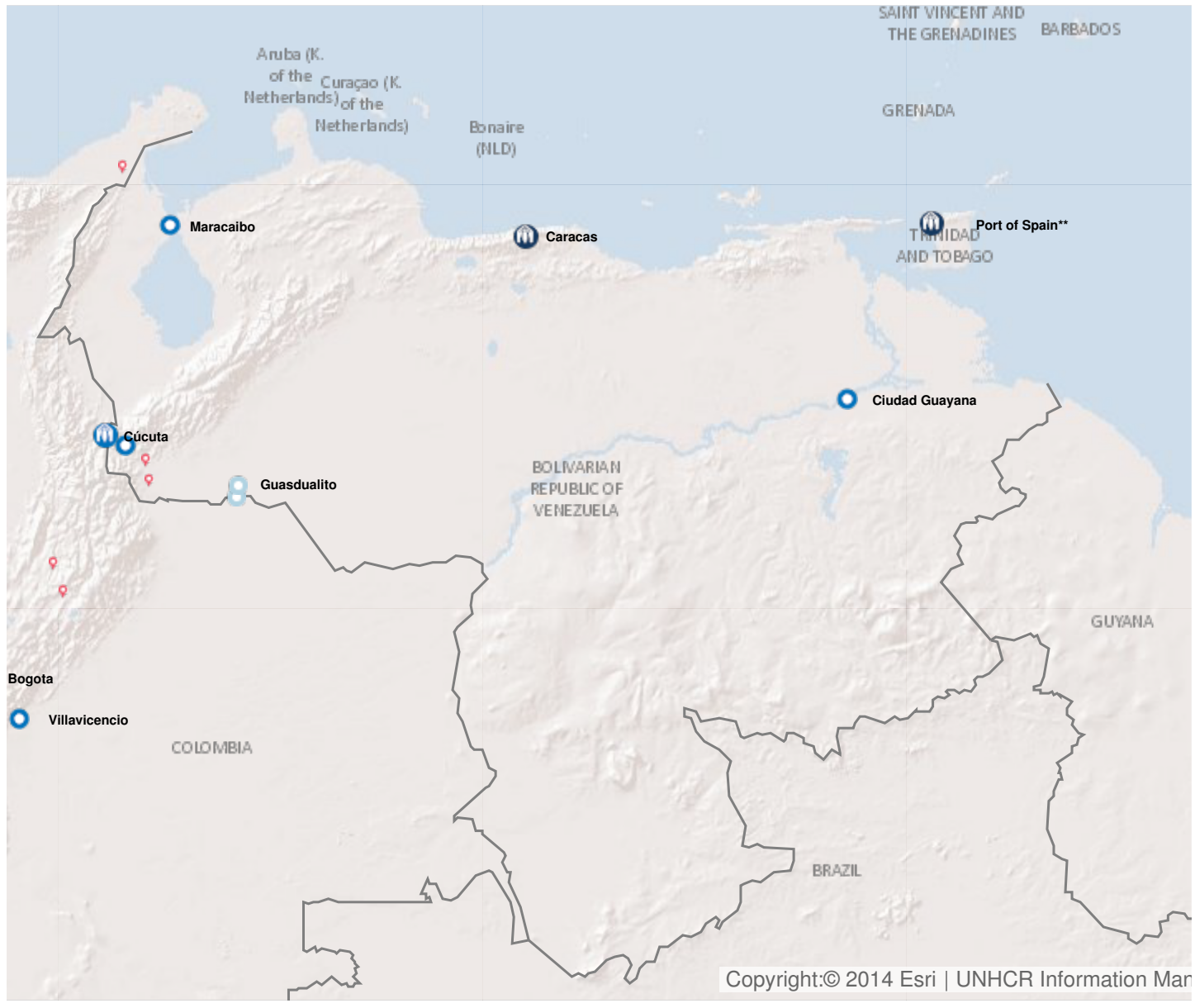
Latest update of camps and office locations 21 Nov 2016.