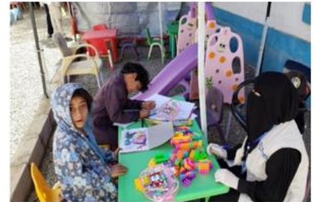
IDP children in Sa'adah enjoy recreational activities at a UNHCR-supported Community Centre, where psychosocial support services were also provided.

In Sa'adah, the centres managed by partner Yemen Development Fund engaged in activities benefitting some 29 children, where toys, games and activities were provided to foster a stable learning environment. Psychosocial support and awareness-raising sessions were also provided. In Al-Jawf, children's recreational activities were provided to mitigate the psychological impact of the conflict. Some 40 children attended recreational activities in Al Ghayl, Al Hazm and Al Humaidat districts.