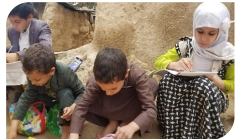
Displaced Yemeni children take part in recreational activities after receiving toys and educational materials from UNHCR partner YDF in As Safra district, Sa'ada governorate.

Escalation in hostilities since the beginning of 2018 in Al-Jawf have left at least 189,340 displaced Yemenis and members of hosting communities in acute need of humanitarian assistance. During the first quarter of 2021, UNHCR and partners conducted needs assessments for more than 4,600 displaced families, the majority of whom arrived from Marib governorate and settled in Al-Jawf governorate. Assessment results reveal displaced families were in urgent need of shelter, non-food items, water, and food assistance. Most displaced families are residing in isolated and rural areas, far from local communities and with little to no access to healthcare, education, water and sanitation facilities. Further information on the situation in Al-Jawf can be found in here .