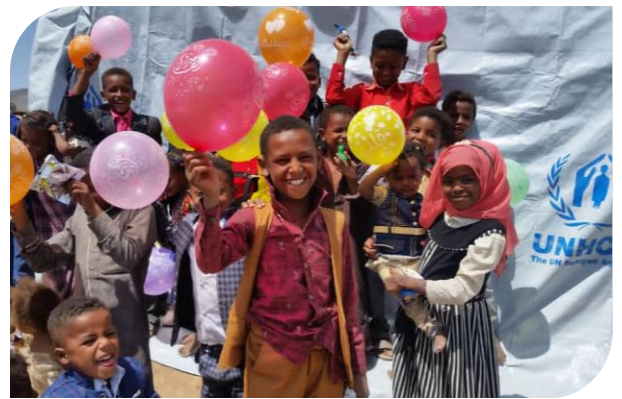
UNHCR and partners organized recreational activities for young IDP children in celebration of Eid in Al-Salam and Al-Wahda IDP hosting sites, Dhamar governorate

During the reporting period, UNHCR distributed emergency shelter kits and core relief items including blankets, jerricans, mattresses and kitchen sets to over 300 families (1,800 individuals). The distributions took place mainly in IDP hosting sites in Sana'a and Marib governorates. UNHCR also provided protection services including psychosocial support and counselling to over 500 individuals. In coordination with partners, UNHCR provided recreational activities to some 60 children in Al-Jadad, Al-Salam and Al-Wahda IDP hosting sites in Sana'a and Dhamar governorates, to address their psychological and social needs due to the ongoing conflict and COVID-19 pandemic.