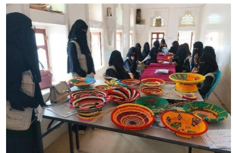
UNHCR & partners train displaced women and host community members in craft making, which has widely thrived within local markets

UNHCR and partners continue supporting women through social activities and skills development trainings. During the reporting period, partner Deem began a 22-day handicraft training for 20 women in Ibb governorate, providing them with technical and business development skills. Similarly, partner YGUSSWP provided literacy classes to 17 women in Sana'a governorate, and partner YRC conducted social activities for 30 women and girls in Kharif IDP hosting site in Amran governorate.