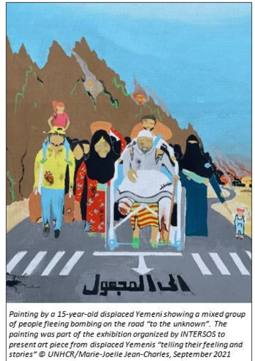
Painting by a 15-year-old displaced Yemeni showing a mixed group of people fleeing bombing on the road "to the unknown". The painting was part of the exhibition organized by INTERSOS to present art piece from displaced Yemenis "telling their feeling and stories"

On 7 September, UNHCR, through the Sub-National CCCM Cluster, conducted a field mission to Al Dhale'e government to meet with the Supreme Council for the Management and Coordination of Humanitarian Affairs (SCMCHA), the IDP response coordinating entity in the North and visit three IDP hosting sites. The visit aimed to assess the humanitarian situation, response, and gaps in these sites. The meeting with SCMCHA mainly focused on updating IDP sites' data and humanitarian access to the sites. During the meeting, SCMCHA highlighted the gaps within the sites, and the cluster team verified the presence of 59 sites in Al Dhale'e and updated the number of families in each site. While SCMCHA emphasized shelter and core relief items as the most critical needs, a pressing need for WASH, food, and education interventions was observed across these sites.