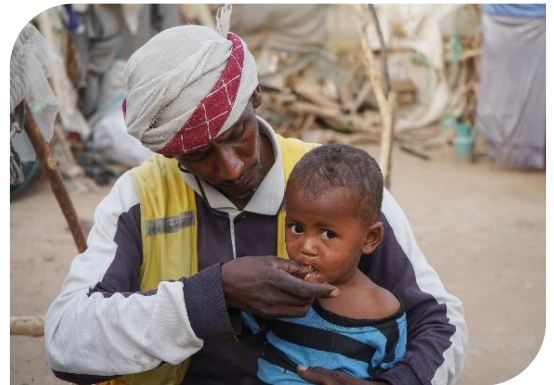
A displaced Yemeni man feeds his child in an IDP hosting site in Marib governorate. Two out of three displaced Yemenis currently live in food insecure areas.

During the first half of 2021, UNHCR distributed more than USD 34 million in cash assistance to over 125,000 displaced Yemeni and refugee families (some 750,000 individuals). A large portion of this assistance targeted displaced Yemenis, who are four times more likely to face hunger than the wider population. Recent post distribution monitoring data revealed that up to 88 per cent of beneficiaries used their assistance towards food needs, while over 30 per cent went towards rent. Cash support has proven an effective modality for enhancing the protection space and assisting vulnerable populations in a dignified manner, whilst contributing to the local economy. However, the needs on the ground remain considerable, as reflected by recent data that indicate two-thirds of displaced Yemeni families receiving cash assistance displayed poor food consumption scores: 62 per cent were forced to reduce meal intakes, up to 31 per cent refrained from sending their children to school, and 14 per cent resorted to child labour to make ends meet.