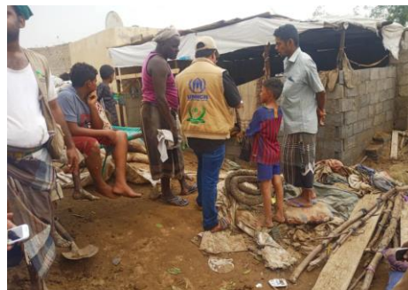
UNHCR's partner conducts assessments for the weather-affected families in Hudaydah governorate © UNHCR/Jeel Al-bena.

Regular monitoring conducted by the UNHCR-led Protection Cluster followed up on previously reported issues relating to the water supply at two IDP sites in Tuban district, Lahj governorate, where some 500 families are currently located. The broken water pumps caused the water supply to be cut off, forcing families to walk long distances to meet their daily needs. As a result, relations with the host community deteriorated, with reported heightened exposure to threats of gender-based violence. The Protection cluster referred the matter to the Camp Coordination and Camp Management (CCCM) Cluster as well as the Water, Sanitation and Hygiene (WASH) Cluster, and work has started to restore water supply at both sites.