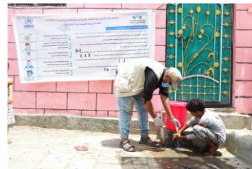
UNHCR's partner staff shows a young boy how to wash his hand at a distribution site in Aden. UNHCR and partners lead COVID-19 awareness-raising activities at distribution sites as part of prevention efforts.

The Shelter Cluster partners in the Hudaydah Hub responded to nearly 9,500 flood-affected families in Hajjah, Hudaydah, Raymah and Al-Mahwit governorates out of some 21,000 families identified in need. Following continued heavy rains and flooding, hundreds of shelters, as well as livestock, roads and agricultural land, was reported destroyed or damaged, with accounts of deteriorating health among displaced families due to waterborne disease. While assessments are ongoing, the current contingency stocks have already been depleted. UNHCR continues to liaise with local authorities for unhindered access to the affected areas and advocate for more funding through OCHA for the shelter response.