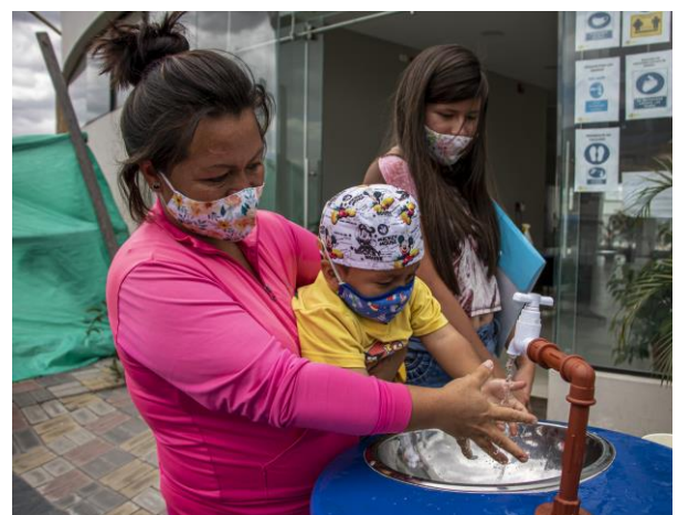
Ecuador. A mother from Venezuela and her child wash their hands at a municipal canteen in the city of Ibarra, where most vulnerable families receive free meals.

In Venezuela, UNHCR operates within the interagency framework to assist the most vulnerable population groups inside the country. In 2020, UNHCR has concentrated its response in 68 communities, principally in border states.