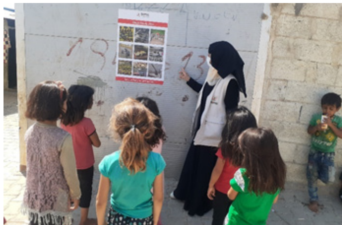
An awareness session on explosive remnants of war (ERW).

UNHCR's protection partners conducted awareness raising and psychosocial support sessions, identified cases and referred them to basic services in Idleb and Aleppo; such community-based protection interventions reached 9,349 people in August. In addition, over 1,300 displaced and vulnerable people received protection services such as awareness raising on civil status documentation and housing, land and properties, legal consultation and assistance.