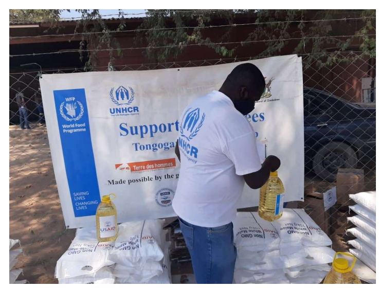
Food distribution preparations in Tongogara refugee camp

Branch Office in Harare Field Office in Chipinge