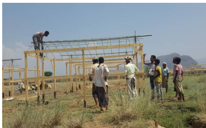
TESK construction in Az Zuhrah district, Al Hudaydah governorate. UNHCR is constructing a total of 8,000 of these shelter solutions in the west of Yemen © UNHCR/JAAHD.

The Shelter Cluster circulated the Winterization Recommendations for 2020-2021 . The Cluster estimated that, between October 2020 and February 2021, some 197,000 vulnerable families will need personal and shelter insulation and heating support through in-kind or one-time cash payments across the country. The Cluster will prioritise IDPs, returnees and vulnerable host community members who live in sub-standard shelter conditions that put them at severe risk. Based on their level of vulnerability, 70,000 families will be prioritised as in acute need of assistance. UNHCR will support the Cluster through CBI response to thousands of IDP and vulnerable host communities, conditional upon available funding.