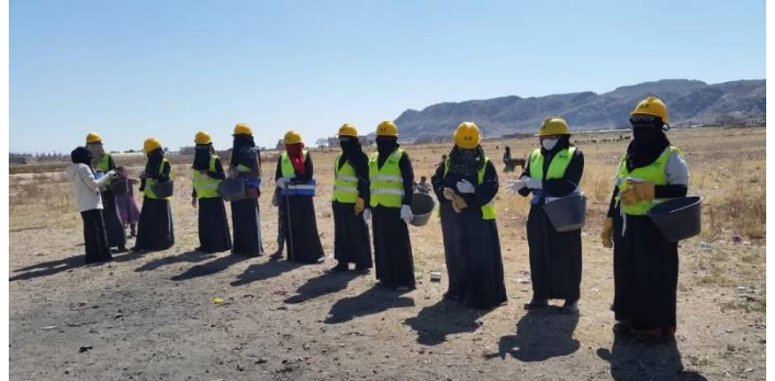
Labors working on site- installing latrines, rehabilitation of water distribution in Dhamar

Special thanks to our major donors: United States of America | Thani Bin Abdullah Bin Thani Al-Thani Humanitarian Fund | Saudi Arabia | Country-based pooled funds | United Kingdom | Japan | Qatar charity | France | Switzerland | Kuwait Society for Relief | Sheikh Eid Bin Mohammad Al Thani Charitable Foundation | Republic of Korea | Qatar | Latter-day Saints Charities | Spain | Canada | Private donors Lebanon | Private donors Saudi Arabia | Private donors United Arab Emirates | Australia for UNHCR | Cyprus | Holy See.