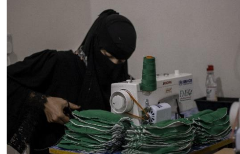
A Yemeni woman makes face masks in Ader

UNHCR worked with 45 Yemeni women from displaced and host communities to produce face masks through a cash-forwork initiative. Each woman will receive USD 340 to produce 2,000 masks. UNHCR will distribute the masks (90,000 in total) to refugees in Taizz, Lahj, Aden, Hadramaut and Shabwah, as part of hygiene kits.