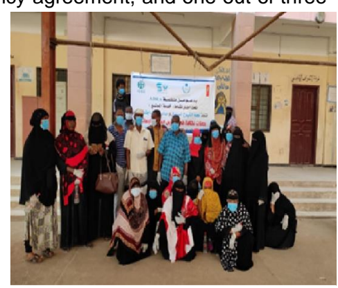
Refugee volunteers pose for a group picture at the end of the cleaning campaign they led in primary schools in Basateen, Aden. ©UNHCR/ADRA, September 2020

Since March with the onset of the COVID-19 pandemic, over 550 Somali nationals arriving from the areas under the de facto authority (DFA)territory controlled have registered in the south. So far, UNHCR assisted 500 of them registration and emergency cash to pay for food and accommodation, including 35 during the reporting period. Close to 170 of these new arrivals also received