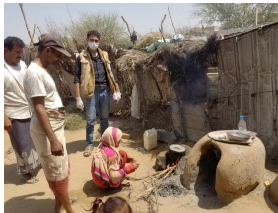
Partner JAAHD supervises a safe energy project in an IDP site in Hudaydah governorate.

During the reporting period, UNHCR and partner JAAHD launched the pilot project “Safe and efficient cooking in IDP sites”. Baseline surveys have already been conducted in two IDP sites in Hudaydah governorate, which host some 100 IDP families. The aim of the project is to significantly improve household safety measures for cooking in IDP hosting sites, and implement sustainable energy methods, such as building traditional clay ovens, which will reduce the risk of preventable fires.