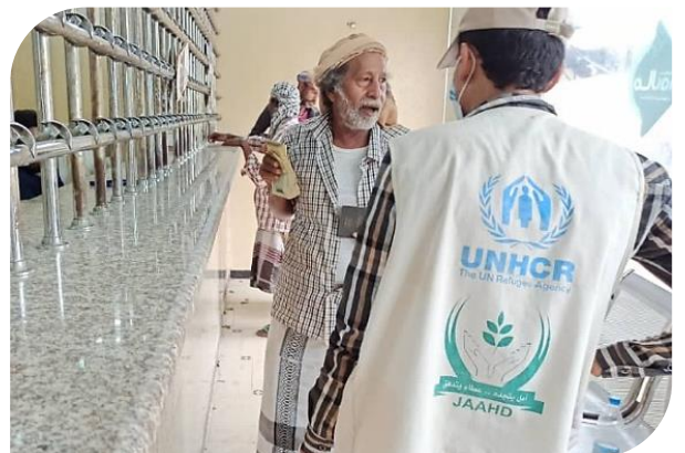
A displaced Yemeni man receives cash assistance in Al-Hudaydah Governorate

Between February and March 2021, UNHCR will distribute cash assistance to over 48,000 vulnerable displaced families (288,000 individuals). So far, close to 70 per cent of the targeted beneficiaries have already received this assistance, which remains a critical lifeline for most families. UNHCR's latest post-distribution monitoring findings reveal that up to 97 per cent of families spend all or part of the assistance on food.