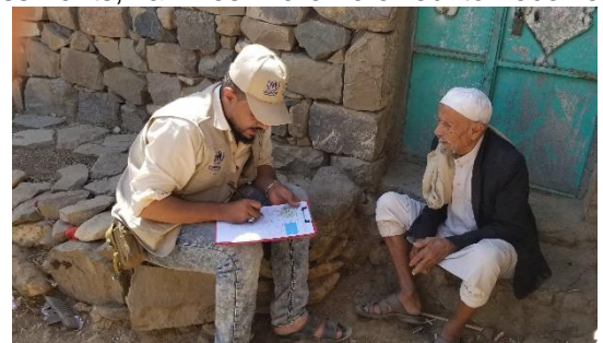
UNHCR partner staff interviews a displaced Yemeni in Ibb governorate to assess his and his family needs

UNHCR also assessed some 6,600 displaced families to identify their needs and priorities. Based on the assessments, families were referred to receive protection assistance, including cash assistance and specialized protection services for vulnerable and at-risk children and survivors of gender-based violence. UNHCR also coordinated with partners for referrals to other services, including healthcare and WASH.