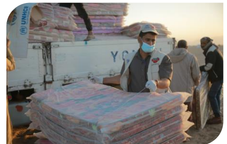
Displaced Yemeni families fleeing conflict in Marib receive core relief items from UNHCR partner SHS in Sirwah district, Marib governorate

provides a comprehensive outline of the humanitarian situation in Yemen, including the most pressing humanitarian needs and estimated number of people in need. Internal displacement remains one of the defining features of the conflict; Yemen currently has over four million internally displaced persons (IDPs), making it the fourth largest IDP crisis globally. In 2021, the situation is predicted to deteriorate further as the severity of needs increases pending a de-escalation in hostilities and improvement of the local economy and infrastructure.