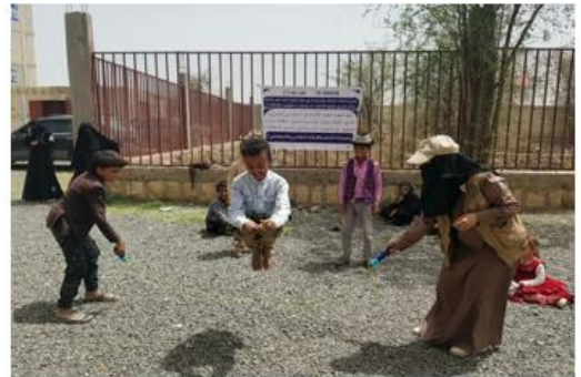
Children competing in a rope skipping competition as part of recreational activities at the distribution center in Umm Al-Momineen Aisha School in Sanhan district. ©YGUSSWP June 17, 2021

During the reporting period, UNHCR distributed 2,700 non-food items (NFI) during the reporting period, benefitting some 16,200 individuals in Amanat Al Asimah, Ibb and Al Hudaydah governorates . UNHCR and partners also provided protection services at community centres and through mobile teams, including protection assessments, legal assistance, psychosocial support, cash assistance, case management and awareness sessions benefitting some 28,800 displaced Yemenis . Activities also included recreational activities for children at community centres supported by UNHCR.