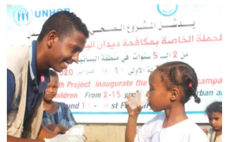
A community health worker provides a de-worming tablet to a young girl in Basateen neighbourhood, Aden governorate as part of UNHCR and partner CSSW's deworming campaign.

On 11 February , UNHCR and partner Charitable Society for Social Welfare (CSSW) launched a de-worming campaign in Basateen neighborhood, Aden governorate, to mitigate anemia and micronutrient deficiency among vulnerable children. Community health workers conducted door-to-door visits and provided de-worming tablets to 4,081 refugees and 1,749 IDPs, as well as host community children.