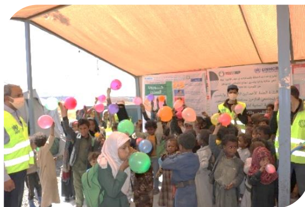
UNHCR and partners organized recreational activities to promote resilience among IDP children and their families in Al-Raqqa hosting site in Hamdan district, Sana'a governorate.

During the reporting period, UNHCR identified eight cases involving child labour in Sana'a. Intensified fighting and the declining economic situation are forcing an increasing number of families to rely on harmful coping mechanisms, including child labour. To avoid reliance on these measures, UNHCR continues to provide psychosocial support and counselling to affected families, taking into consideration the child's best interest. UNHCR further provides a variety of recreational and other activities