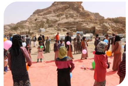
UNHCR and partners provided psychosocial support as well as recreational activities for children residing in the Shibam Al-Gharas camp, Bani Hushaysh District, in Sana'a governorate.

The UNHCR-led Protection Cluster issued its latest Protection Brief , which provides a comprehensive overview of the current protection environment in Yemen with a particular focus on children, people with disabilities and older persons. The Brief also provides an extensive summary of the Cluster's key achievements in 2020. More than four million vulnerable Yemenis received a wide range of protection services including legal assistance, prevention and response to gender-based violence, awareness-raising activities, child protection, and emergency cash assistance, among others.