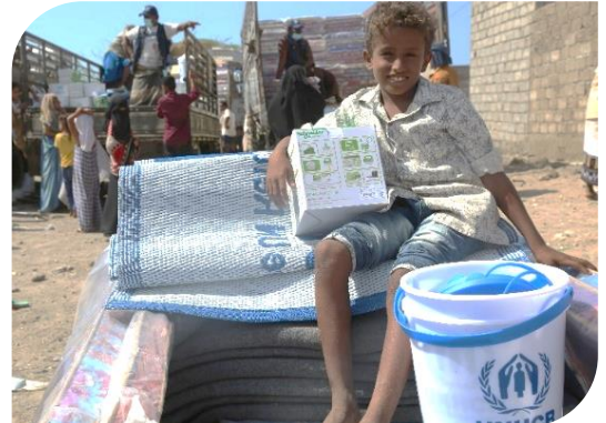
An IDP boy receives emergency supplies at a distribution site, where NFI and shelter kits were distributed to displaced Yemeni families in Taizz and Lahj governorates.

UNHCR has dispatched 200 Enhanced Emergency Shelter Kits (EESKS) and 500 Non-Food Item (NFI) kits to Taizz governorate, with an additional 200 EESKs and 700 NFIs on the way . Since early March 2021, the western borders of Taizz governorate have witnessed increased hostilities. Civilian infrastructure, including schools, markets and houses have been significantly damaged by recent clashes, resulting in at least 120 civilian casualties and a wave of new displacement, with over 1,000 families (7,000 individuals) newly displaced in Taizz since the beginning of the year. A Rapid Protection Assessment conducted by UNHCR partner INTERSOS revealed that those newly displaced are in urgent need of shelter, food, water, and protection assistance. Many displaced families are forced to share shelters — with an average of three to five families under one roof — limiting privacy and increasing exposure to communicable diseases and protection risks, particularly for women and girls. For further information, see UNHCR's Update on the humanitarian situation in Taizz.