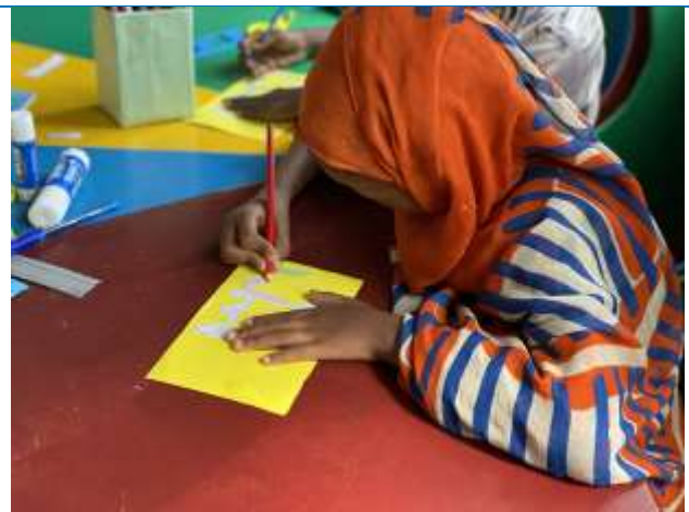
A young Somali refugee draws a picture at the early intervention centre in Kharaz refugee camp, in Lahj, Yemen. The centre, run by UNHCR partner Interos, offers children with special needs a safe environment to develop basic skills until they can integrate into the formal education system. © UNHCR/Marie-Joelle Jean-Charles, February 2020

Percent of registered refugees in Kharaz Camp are elderly (>60 years old)