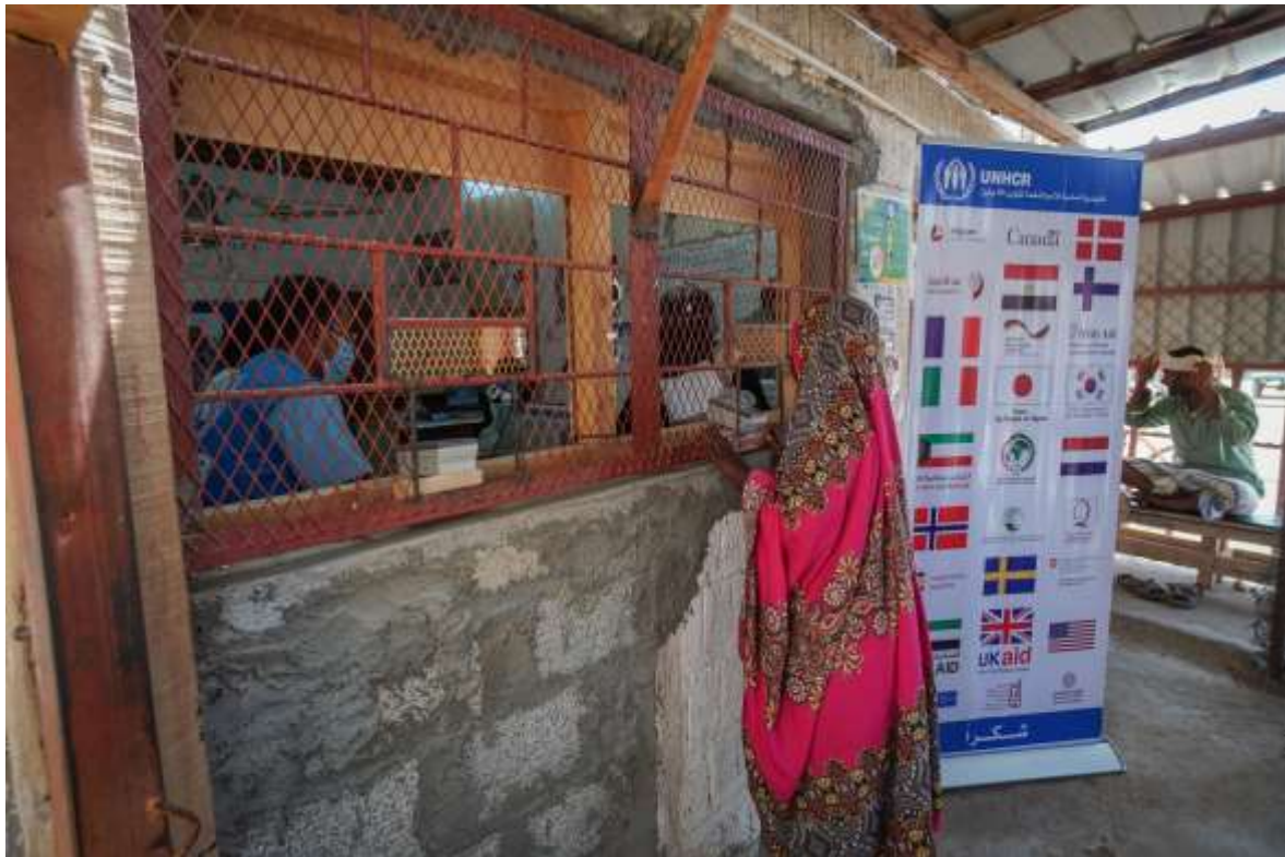
A refugee woman waits to receive her hygiene kits composed of soaps, detergent and sanitary pads at a distribution site in Kharaz Refugee Camp. © UNHCR/ YPN Media, March 2020.