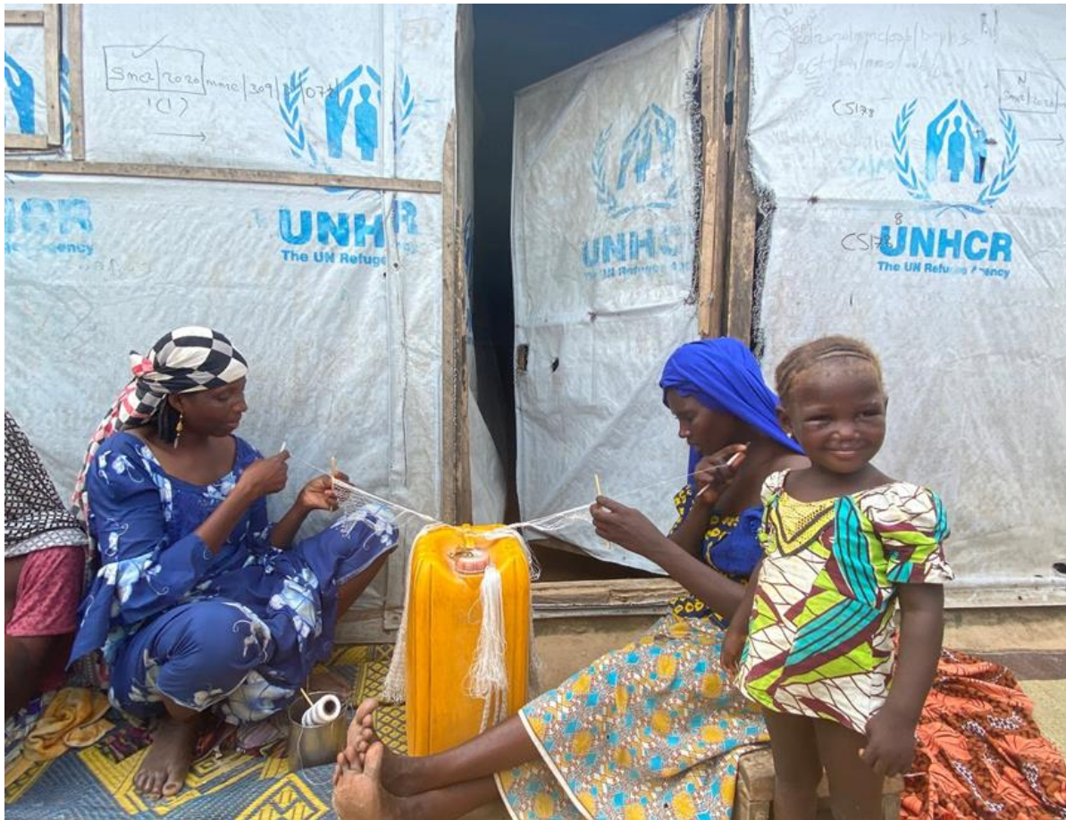
IDP Women in Stadium camps are preparing for return amidst the COVID-19 pandemic.