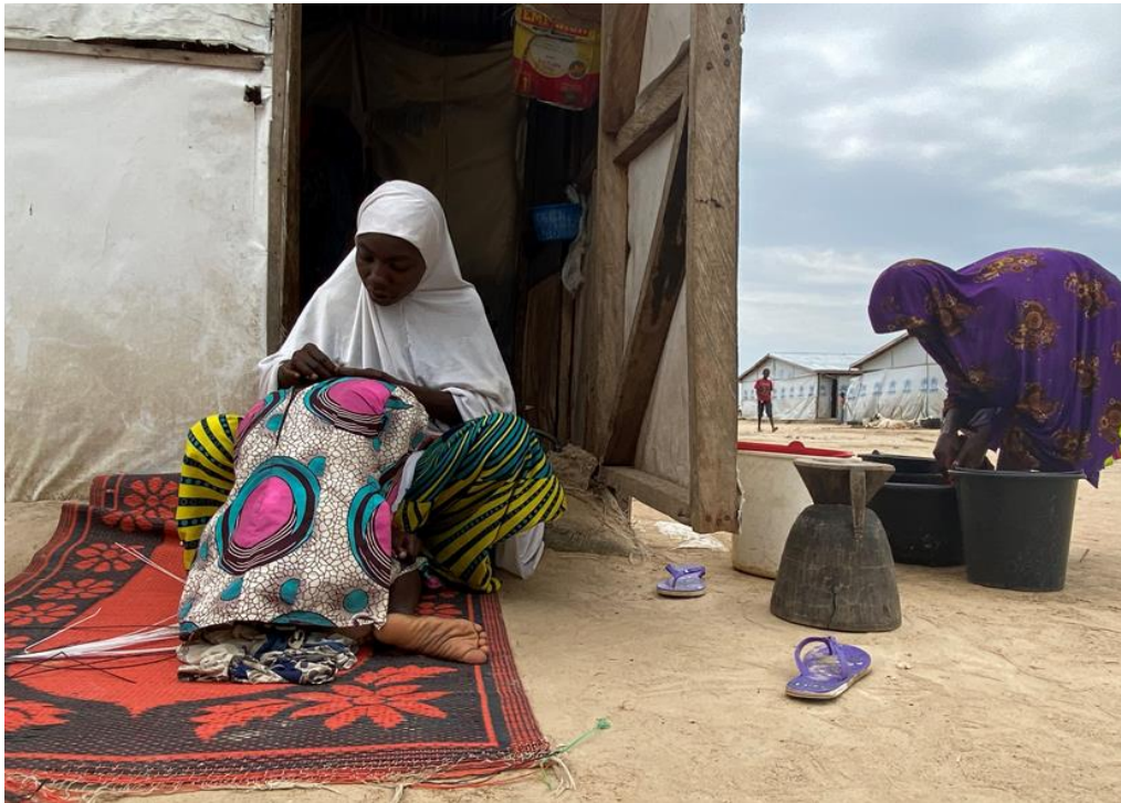
IDP Women in Northeast Nigeria preparing for return home with the assistance of UNHCR. ©UNHCR, Danielle Dieguen Oct. 2020

forcibly displaced population is also increasing the risk of resorting to negative coping mechanisms, including child labour which UNHCR is monitoring closely.