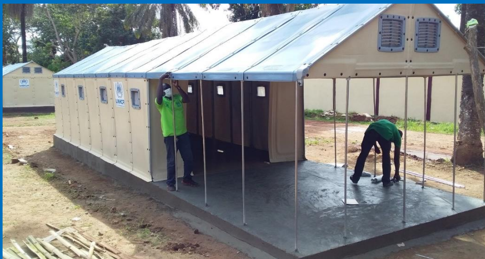
Installation of RHUs by UNHCR's partner AIRD at the University Hospital of Bambari.

UNHCR has also supported the reintegration of the repatriated refugees in their areas of return through a combination of shelter, NFI and cash interventions. UNHCR's assistance also targeted host communities to ensure peaceful coexistence and was complemented by inter reinforcement of public infrastructure including water distribution and hygiene systems, health posts and schools. Since the beginning of 2020, over 14,000 households benefited from NFI distributions, 15,000 households received shelter support and 7,000 persons were targeted for cash-based interventions.