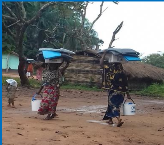
Beneficiaries from a distribution of Shelter materials and NFIs in Bambari in October 2020.

Although the number of returns has decreased significantly in 2020, due to the COVID-19 and the restrictions to international and domestic movements, refugees from Central African Republic have been returning from neighboring Cameroon, Republic of Congo and DRC to their places of origins. Despite the operational challenges caused by the pandemic, UNHCR has facilitated over 1,500 of these returns and applied preventive measures to mitigate the risk of COVID-19 infection. These measures included enforcing social distancing in