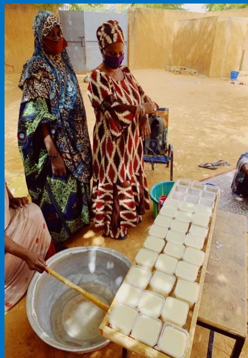
Soap production by refugee in Niger as part of UNHCR's COVID response.

Beyond the positive results in terms of emergency response, this activity is an excellent temporary replacement for many psychosocial activities who have to be put in stand-by due to the forced social distancing required by the COVID-19 situation. The activity also help many vulnerable displaced persons to cope with the situation and to develop hope and resilience in their current situation.