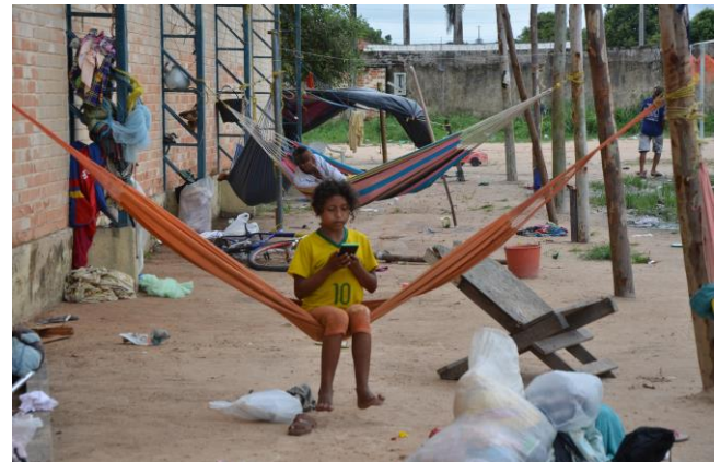
Venezuelans rest outside the shelter in the Boa Vista border city in Roraima state, Brazil. The indigenous Warao prefer sleeping in hammocks, so some have set up their spaces outside the shelter's walls. UNHCR has been working with authorities and partners to establish better living conditions, including access to clean water and medical services.