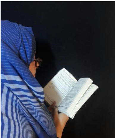
International Day of the Girl Child is celebrated on 11 October of every year

In October, the UNHCR Counselling Line responded to 18,751 calls. The majority of callers enquired about resettlement (57%) followed by financial assistance (15%), and calls were received from 72 provinces across the country but mostly from Istanbul followed by Gaziantep and Ankara. Some 2,280 calls came from the separate counselling line for individuals at risk of, or survivors of, SGBV providing both a recorded counselling message on reporting mechanisms and available support channels and services, and SGBV-related counselling through experienced operators. Out of around 990 individuals who chose to be connected to an operator for counselling, over 600 received SGBV-related counselling while around 385 were transferred to UNHCR's regular counselling line.