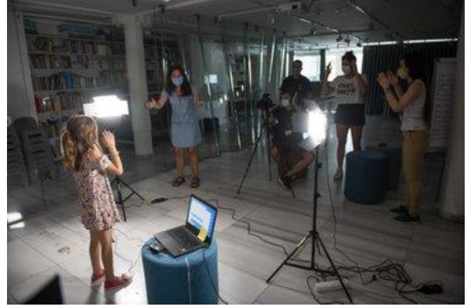
Preparations for the online concert by the Together Strong Voices II Choir that took place within the performances of the 48 th Istanbul Music Festival