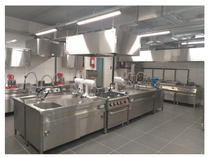
Refugees benefit from Turkish language classes at PECs and then proceed to vocational training courses. Workshops, computer labs and kitchens have been refurbished, and vocational courses are expected to start soon benefitting both host and refugee communities.