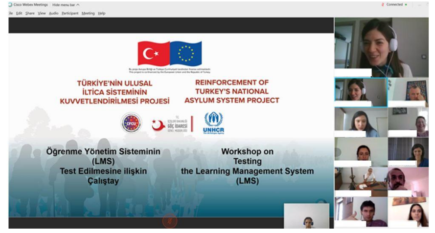
DGMM and UNHCR working together to develop alternative training methodologies to replace in-person training.

The 11th Active Training for DGMM and PDMM staff was held virtually 5-14 August and consisted of theoretical and practical sessions providing participants with a comprehensive knowledge of international protection status determination. Interactive methodologies, such as in-app tools and online platforms for conducting tests and evaluation, were used by facilitators. The training received increasingly positive feedback from the participants. In addition, a two-day online Specific Training on Interviewing Techniques for involved in international protection status determination was held on 31 August and 1 September.