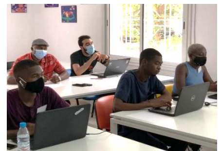
Refugee and asylum-seekers take part in a coding boot-camp organized by We Code Tunisia and Power Coders.

UNHCR Tunisia is grateful for the support of: Austria | European Union | Japan | Luxembourg | Monaco | Netherlands | RDPP North Africa – EU | Switzerland and to those who have contributed to UNHCR programmes with unearmarked and softly earmarked funds