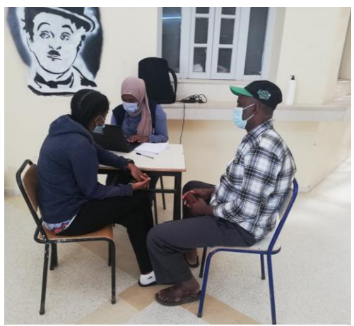
Registration of the rescued at sea

During the month of May, 2,102 vulnerable refugees and asylum seekers received cash assistance. Of these, 477 are hosted in UNHCR shelters and apartments and 297 others live in urban and rural areas.