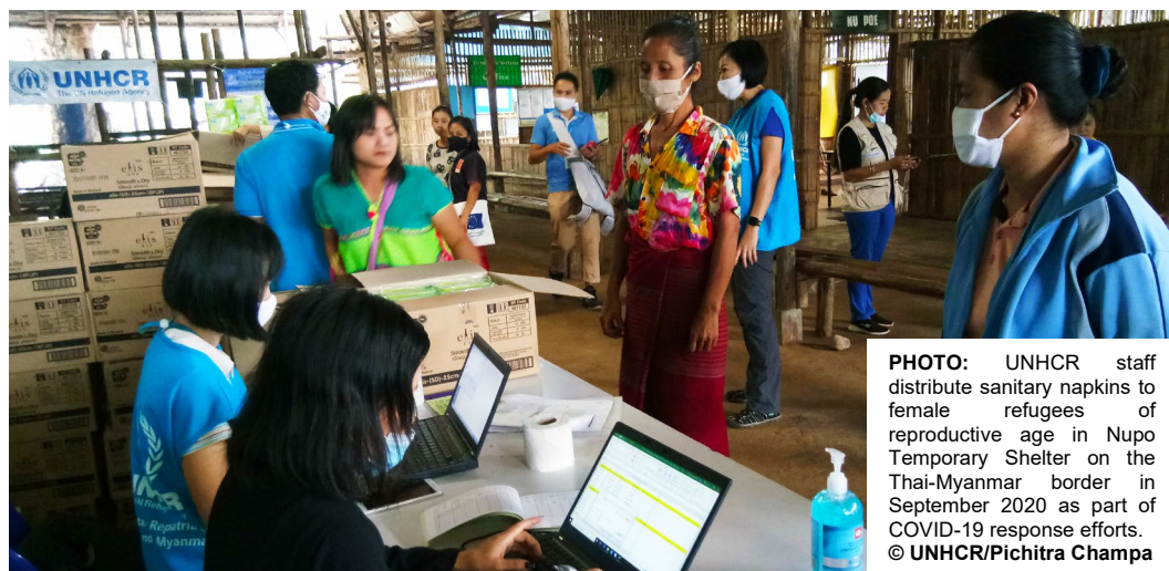
PHOTO: UNHCR staff distribute sanitary napkins to female refugees of reproductive age in Nupo Temporary Shelter on the Thai-Myanmar border in September 2020 as part of COVID-19 response efforts. © UNHCR/Pichitra Champa

1 Multi-Country Office in Bangkok 2 Field Offices in Mae Hong Son and Mae Sot