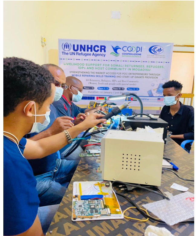
As part of UNHCR's livelihoods initiative, participants in a mobile phone repair workshop at COOPI in Mogadishu