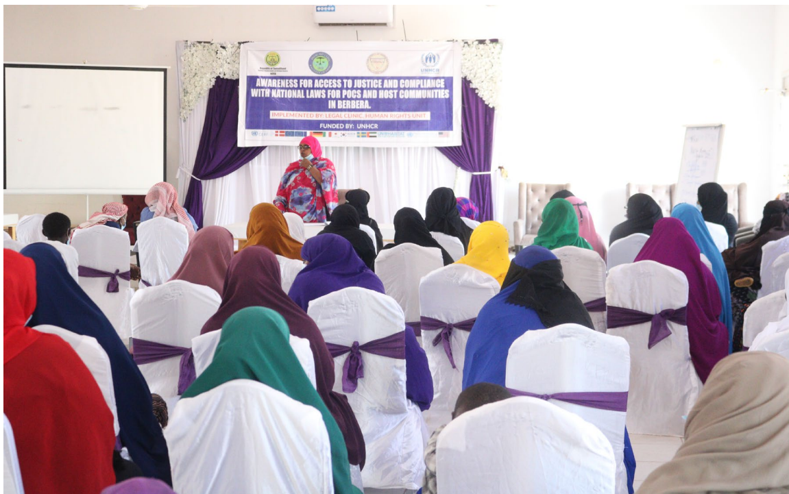
UNHCR partner Legal Clinic held a SGBV awareness-raising for PoCs and host communities in Berbera, Somaliland.