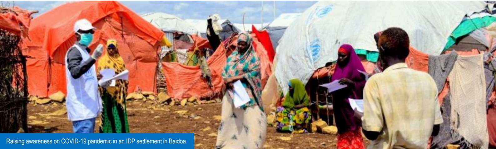
Raising awareness on COVID-19 pandemic in an IDP settlement in Baidoa.