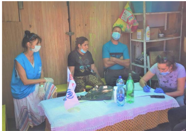
Meeting with RAE IDPs in Mladenovac, August 2020

UNHCR Covid-related deliveries surpassed the value of 203,640 USD with the delivery of 800 bed linen sets (donated by IKEA) and 500 scabies creams delivered to Reception/Transit and Asylum Centres in Serbia.