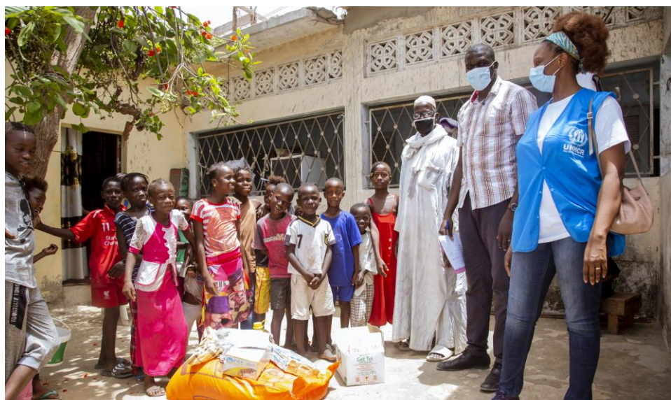
Senegal / Distribution of Covid-19 assistance to refugees