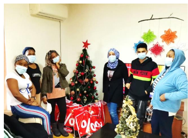
Children accommodated in Loznica Home for UASC were happy to receive New Year's presents, ©UNHCR, December 2020

On 17 December, a riot took place in Bogovađa Asylum Centre, which accommodates unaccompanied and separated children (UASC). Luckily, no one was seriously injured, however, as reported by Serbian Commissariat for Refugees and Migration (SCRM), the facility was substantially damaged. The police calmed the situation and 79 UASC were transferred to Preševo Reception/Transit Centre. UNHCR, Indigo and SCRM identified 13 most vulnerable minors and are following up on their needs. On 24 December, the Ombudsman launched an investigation to establish the circumstances of the incident; the following day, the police arrested five Afghan minors for suspected coercion, abuse and damage to reputation on the grounds of religious, ethnic and other affiliation, and for destruction of property. The minors remain in detention pending investigation.