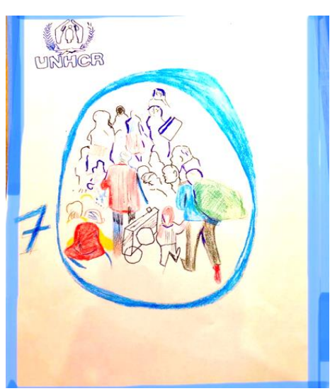
Youth event on occasion of UNHCR 70th anniversary and a young refugee's piece of art as present to UNHCR

UNHCR and Jesuit Refugee Service (JRS) staff began preparations for enrolling two young adults, proteges of JRS UASC House, into university. Thanks to donation of LED Ekran company, six boys and girls accommodated in UASC House of Rescue in Loznica were all equipped with proper footwear and received New Year's presents. Partner Indigo distributed 200 New Year's parcels to children accommodated in six reception centres and UASC Homes. Partner PIN provided psychological and psychosocial support to 121 adults and UASC in Banja Koviljača AC and Šid RTC, Vodovodska and Zmaj UASC homes as well as remotely. Partner IAN implemented two days of community support trainings for asylum-seekers accommodated in Krnjača AC and in private accommodation. CRPC and Indigo organised over 150 educational, creative and recreational workshops for children and adults in nine reception centres and UASC Homes throughout the country.