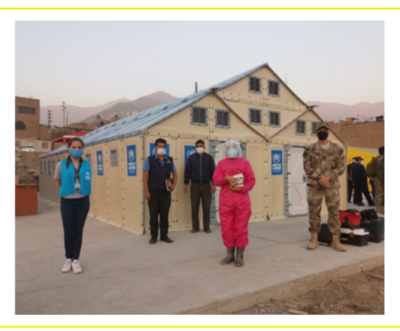
RHUs set-up to enhance hospital response to COVID19 in Lima.

Some 720 primary health orientations have been carried out in Lima and Tumbes by UHCR and partners.