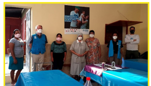
Hermanas de Santa Ana soup kitchen

More than 4,400 kits have been distributed by UNHCR and partners, including baby kits in Cuzco and Tacna, hygiene kits in Lima, and mosquito nets, masks, clothes and kitchen sets in Arequipa, Lima, Cuzco, Tacna and Tumbes. Also, since the start of the Emergency, over 17,870 thermal blankets have been distributed nationally.