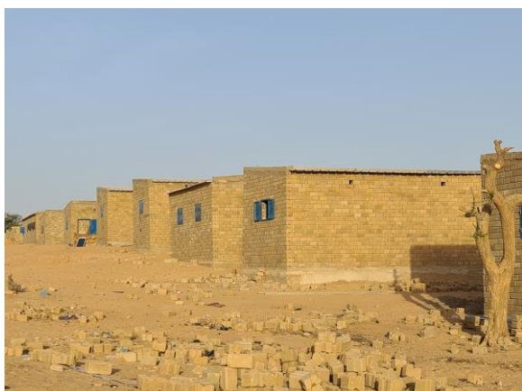
Construction of social housing for the most vulnerable refugees and host households is ongoing in the Tillabery region. UNHCR has pledged to construct 4000 social houses in Tillabery