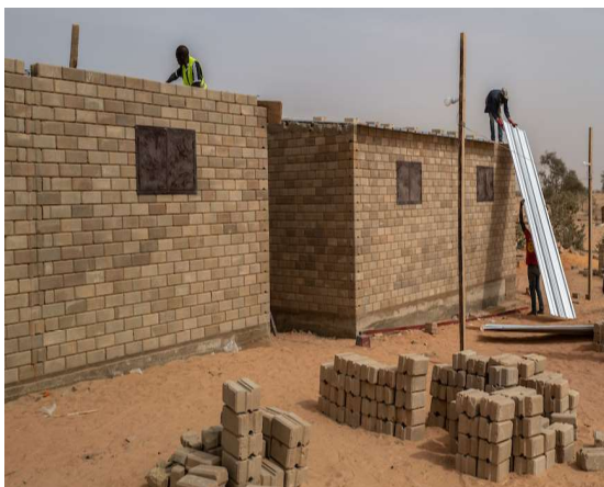
Construction of social housing for the most vulnerable refugee and host households is ongoing in the Tillabery region. UNHCR has pledged to construct 4000 social houses in Tillabery