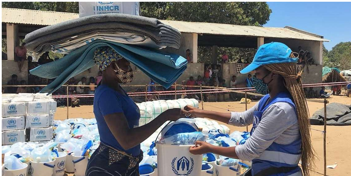
UNHCR staff distributes core relief items to a displaced woman in Cabo Delgado Province, Mozambique.

As the situation in Cabo Delgado continues to deteriorate, UNHCR is preparing for a longer-term response in northern Mozambique. It is critical that UNHCR receives adequate funding to maintain and further strengthen its work in the interest of displaced people and those affected by the violence.