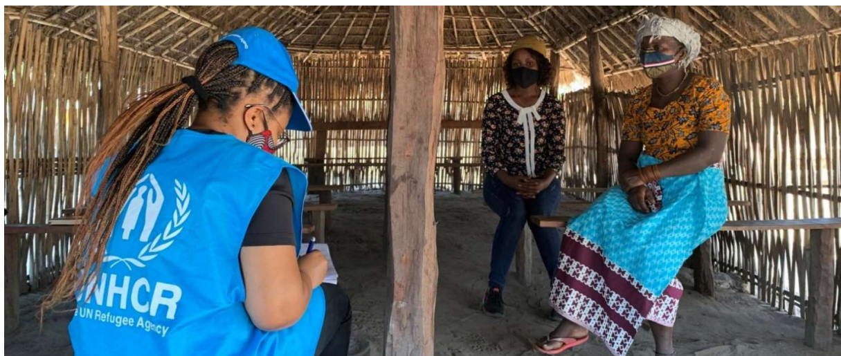
UNHCR Protection Officer speaks with displaced women in Cabo Delgado Province, Mozambique.

*NB: The provision of protection services requires significant investment in staffing.