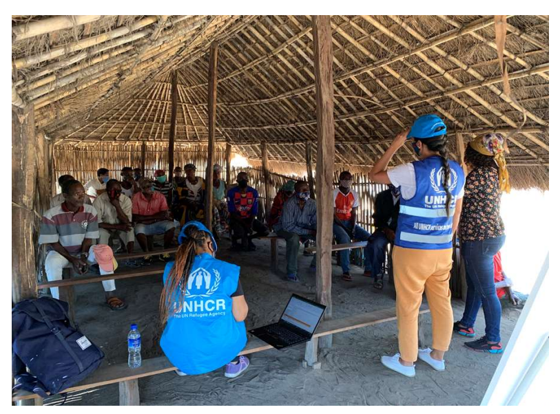
Focus group discussions in Montepuez District, Cabo Delgado Province, to assess possible livelihoods interventions in the area.