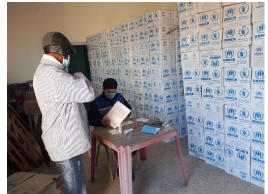
Distribution of food assistance in Misrata.

Last week, UNHCR's partner, CESVI provided cash assistance to a total of five refugees and asylum-seekers living in the urban community. This included regular cash assistance to one person and emergency cash assistance to four individuals. Emergency assistance was also provided to three individuals from Somalia and Sudan who were recently released by traffickers operating in Bani Walid. Partner, the Danish Refugee Council, also started its fourth distribution of pre-paid cash cards in Tripoli reaching 281 internally displaced families (approximately 1,405 individuals).