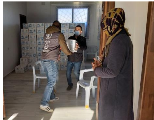
Distribution of food assistance in Al Zawia.

UNHCR's food parcel distributions continue in coordination with the World Food Programme (WFP). This week, a total of 2,000 refugee and asylum-seeker families in Misrata (190 km east of Tripoli) received food parcels to last for one month. Similarly in Al Zawia (45 km west of Tripoli) and Zwara (102 km west of Tripoli), 444 families also received food parcels to help them cope with economic constraints caused by COVID-19. Since 2020, UNHCR and WFP distributed food parcels to 13,311 refugees and asylum-seekers.