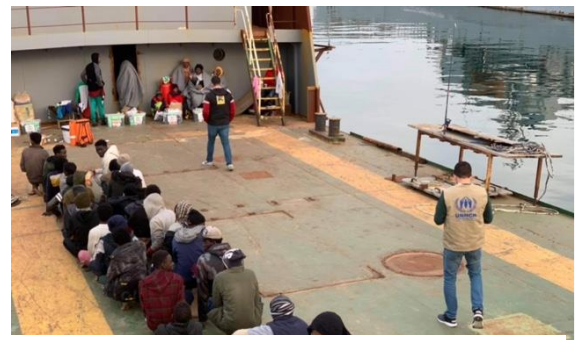
UNHCR's team present at the disembarkation point to provide assistance during the arrival of individuals at the port.

As of 22 February, 2,515 refugees and migrants have been registered as rescued/intercepted at sea by the Libyan Coast Guard and disembarked in Libya. On 20 February, some 280 individuals arrived at the Tripoli Naval Base. UNHCR medical partner, the International Rescue Committee (IRC), were present at the disembarkation point to provide urgent medical assistance and core relief items (CRIs).