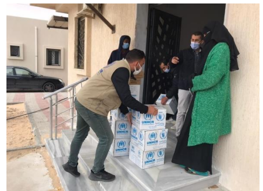
Provision of food parcels at Zwara

UNHCR's response to COVID-19 pandemic further continues with support to communities in Libya. Last week in Misrata, UNHCR, together with partner LibAid and in coordination with the Misrata Municipality, provided sanitary cloth to three public health care clinics. The distribution is part of UNHCR's quick impact projects (QIPs) programme and will benefit internally displaced (IDP), returnee, and host community populations living in and around Misrata.