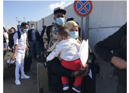
In Tripoli, evacuees arrive at the airport to embark on the flight to Rwanda ETM.

On 19 November, UNHCR evacuated a group of 79 vulnerable asylum-seekers out of Libya to safety in Rwanda, to the Emergency Transit Mechanism (ETM), agreed and set up in mid-2019 by the Government of Rwanda, UNHCR and the African Union. Most of the group were living in Tripoli, but many had previously been held in detention. Flights from Libya to Rwanda had been on hold for nearly a year due to COVID-19-related worldwide movement restrictions. The group all PCR tested negative for COVID-19 prior to embarkation.