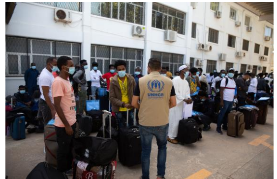
Evacuees at Mitiga airport, Tripoli, await embarkation for their flight to ETM Niger.

On 15 October, UNHCR evacuated a group of 153 vulnerable refugees and asylum-seekers out of Libya to the Emergency Transit Mechanism (ETM) in Niger. This marks the end of a seven-month long suspension of evacuation flights from Libya, due to the COVID-19 pandemic; all passengers tested negative prior to departure. The majority of evacuees had experienced arbitrary detention in Libya – with some detained for more than two years. UNHCR is grateful for the support of the Libyan authorities for facilitating the procedures that led to this long-awaited flight. Evacuees will now receive humanitarian assistance at the ETM, including shelter, food, and medical care while further options for them, such as resettlement, are pursued. In 2020, with this latest flight, UNHCR has now assisted 502 vulnerable refugees out of Libya, including 221 resettled in Europe.