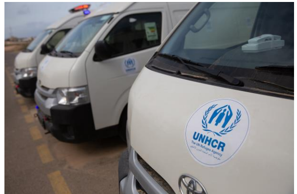
Provision of three ambulances to three municipalities in Tripoli.

distributed some 127 hygiene kits as well as sanitary cloth, in coordination with local authorities of Zawiya. These initiatives come within the framework of UNHCR's support for the health sector in Libya during the COVID-19 crisis. QIPs are small, rapidly implemented projects intended to help create conditions for peaceful coexistence between those displaced and host communities, and to strengthen the resilience of these communities. So far this year, UNHCR implemented 31 QIPs targeting the educational and health sectors.