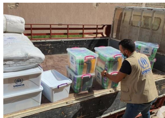
Distribution of hygiene kits to COVID-19 isolation units in Zawiya.

Cash assistance continues to be provided to help persons of concern living in the urban community. Last week, partner CESVI provided cash assistance to a total of 356 refugees and asylum-seekers living in the urban community in Tripoli (144 families). This included regular cash assistance to 262 individuals (96 families) and emergency cash assistance to 94 individuals (48 families). As of 8 October, a total of 2,862 refugees and asylum-seekers were provided with cash grants.