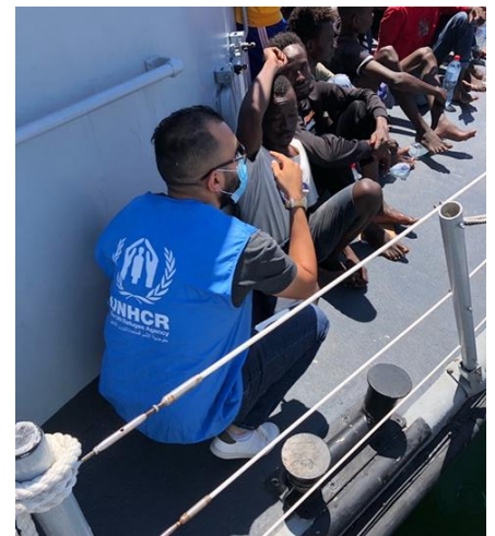
UNHCR at the Tripoli Naval Base upon arrival of refugees and migrants to port.

Special thanks to major donors: Canada | Denmark | European Union | Finland | France | Germany | Italy | Japan | Norway | Sweden | Switzerland | The Netherlands | United Kingdom | USA | Private Donors